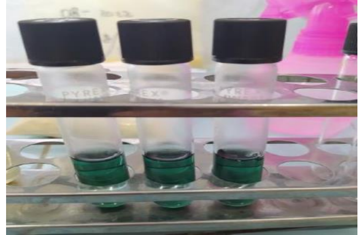
Fig 2. Coliform confirmation test results on BGLB media (positive results have gas bubbles)

Based on the results obtained in the confirmation test (Figure 2), it shows that all of the tested T. obesus samples do not meet the requirements and exceed the quality standard threshold that has been set by SNI 2332.1:2015 regarding the quality requirements of T. obesus which states that the maximum level of Coliform bacteria of < 3 MPN/g. Based on the test results with samples of T. obesus fish meat, it shows that the MPN Coliform value in the T. obesus sample obtained at TPI with a value of 15.2 (MPN/g) contains lower contamination when compared to PIK, which is 61.3 (MPN/g). The more positive tubes, the lower the quality of the sample. On the other hand, the fewer positive tubes, the higher the quality of the sample<sup>9–11</sup>.