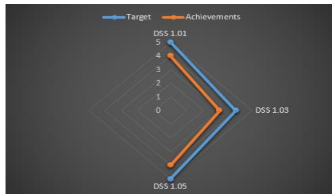
Fig 2 Spider network graph

The above table is the result of the references in tables 1 to 3, while the values obtained such as Running Operational Procedures have gotten very good results in the agency at capability level 3.75 and rounded up to 4 to facilitate finding the latest conditions based on the capability level criteria has been determined, but still has risks such as inaccessible databases causing disrupted running of applications, this risk arises due to lack of maintenance of information technology devices that are not following procedures [1]. Monitoring IT infrastructure has gotten pretty good results at the agency at the capability level 3.5 and rounded up to 3 to make it easier to find the latest conditions based on predetermined level capability criteria, but still has risks such as use over memory capacity can also make applications hampered such as too many electronic certificate requests that will burden the server so that the need for